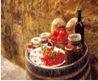
Enjoy the beauty of spring with hors d'oeuvre, a glass of wine and Panache's house-made breads.

"It's beneficial to taste different wines with various categories of food, creating your own taste palate. Remember that its okay to find what you like and stick with it." says Jay Sengstock, of Beverages & more!