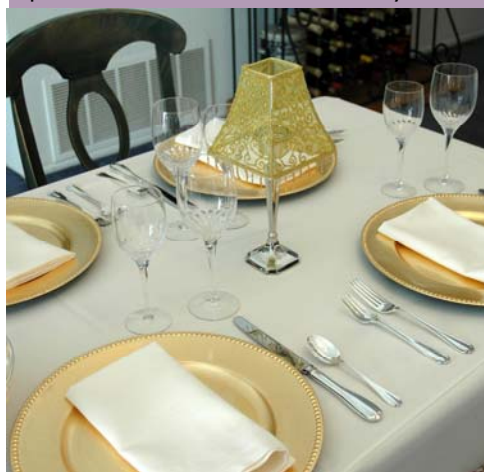
The table is set with chargers, silver and crystal, but dinner is still hours away. Advance preparation is important even for a small gathering.