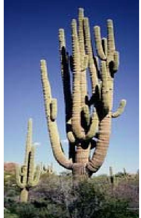
This huge cactus is known as "Carnegiea Gigantea Schwarzenegger"

The Desert is as fragile as it is fierce and treating it gently will ensure that it is available for all of our winter holiday visits for decades to come.