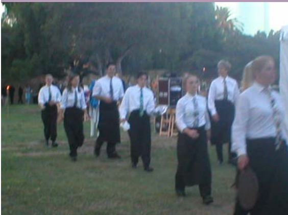
Here a team of servers gets ready for a bussing and water glass filling relay. Below a candidate for camp demonstrates what he can bring to the party.