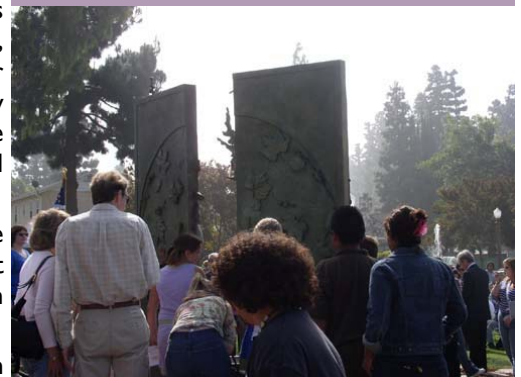
"Through the Garden Gates" greeted by Whittier