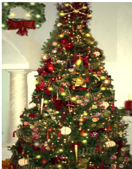
Christmas lights create welcoming warmth

presents that would be received and presents that would be given. It was a time of special lights, special decorations and special food. My heart would lighten as soon as the first holiday decorations appeared in shop windows, it became more elevated still as homes were decorated. By the time school let out in my heart the winter had turned to summer.