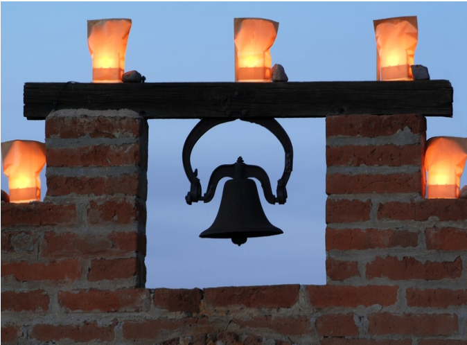
Luminaries frame a mission bell, as the holidays are welcomed in the Southwest with the light and sounds of thanks and celebration

Enjoy All of Life's Flavors With Those You Love . Happy Holidays From Parties By Panache.