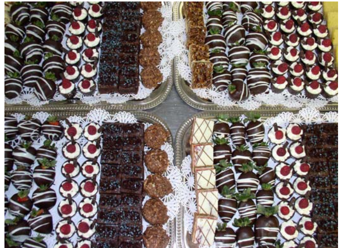
Reina and Etelvina create a tapestry of delectable holiday treats , which are a feast for the eyes as well as a feast for the taste bud.