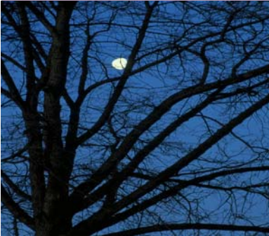
No need for Rudolph's nose on this moon lit Christmas Eve.