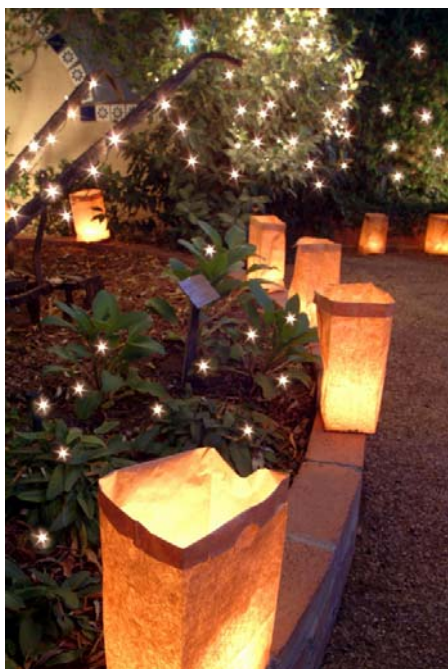
Luminaries light the way for family and Friends