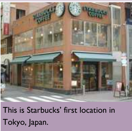
This is Starbucks' first location in Tokyo, Japan.