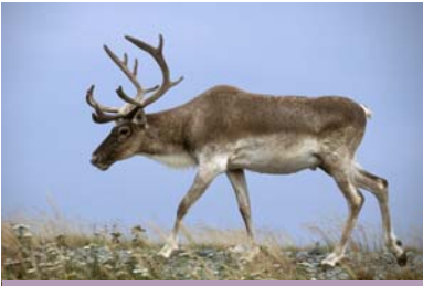
Comet on his way to work at Santa's