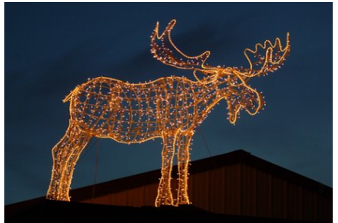
Somehow you can usually tell just how much fun a holiday party is going to be. Happy Holidays from the crew at Parties By Panache!