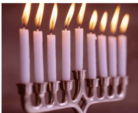
Menorah lights celebrate ancient traditions