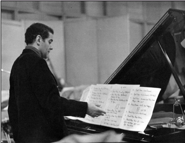
George Russell photographed by Kirsten Weinoldt, while playing with the Danish Radio Big Band in 1983