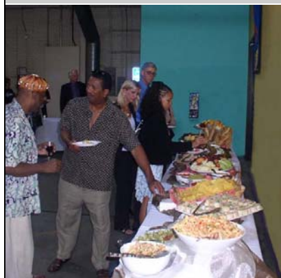
Musicians, Staff and guests enjoy the buffet and conversation.