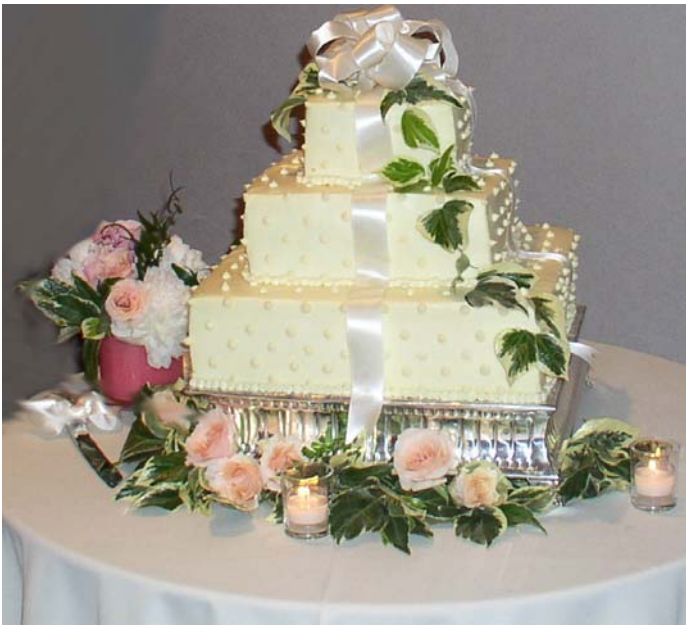
The cake consisted of a top chocolate layer, middle lemon and bottom layer of carrot cake. This wedding cake was eaten.