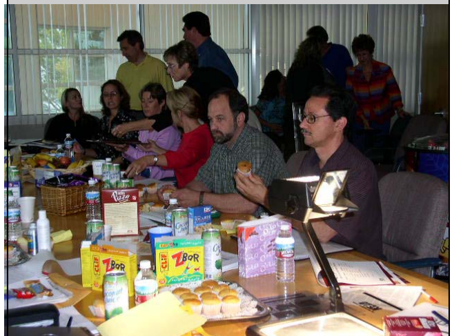
The Buyer’s evaluate and decide to go with KĒTO Food’s low carb pasta, sauces, muffin and Brownie mixes.