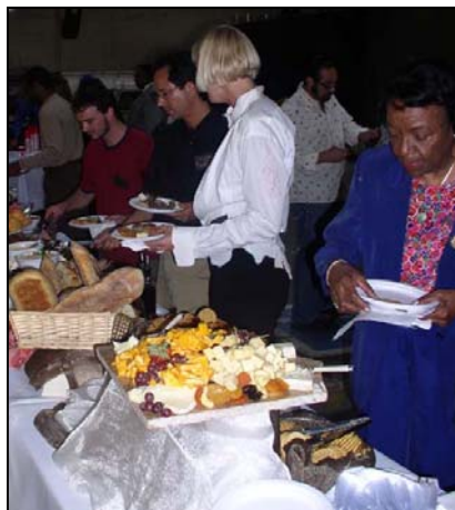
Parties By Panache created a colorful jazz inspired meal for the JJA Awards.