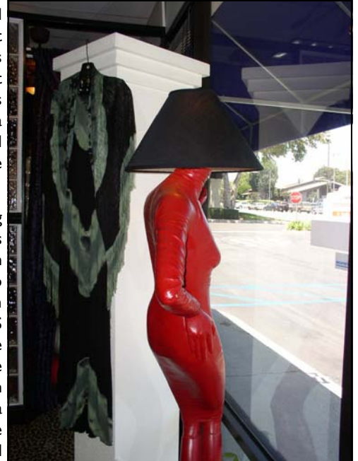
The Red Lamp and Brea Blvd. as seen from inside ARTRAGOUS

Artragous 351 S. State College Blvd. Brea, CA 92821 (714) 257 1498