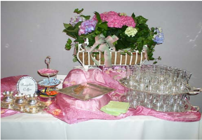
The coffee station during set up for the Reception