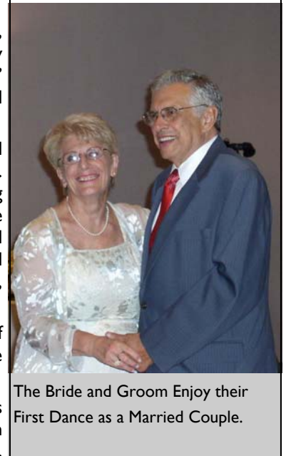
The Bride and Groom Enjoy their First Dance as a Married Couple.