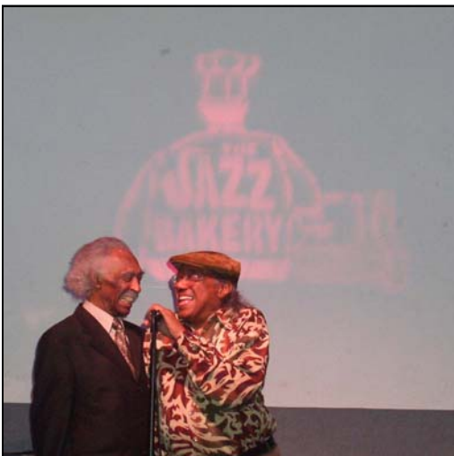
Gerald Wilson and Horace Silva enjoying the moment as Horace receives his award