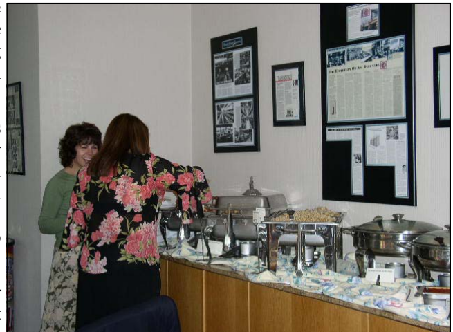
KĒTO Food’s pastas and sauces are a big hit with Nature’s Best buyers