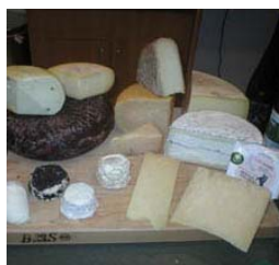
An "All California Selection"

Our July issue will feature the Pacific White Sturgeon and California Sturgeon Caviar.