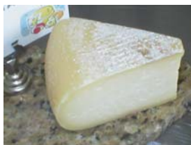
Carmody looks beautiful and tastes better.