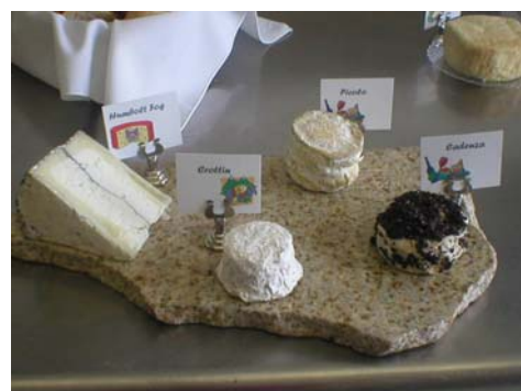
A bunch of real softies: clockwise Picolo, Cadenza, Crottin, Humboldt Fog