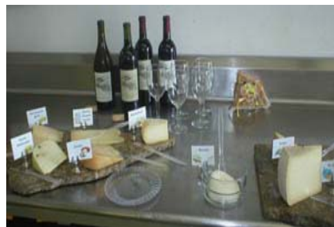
Set up for a staff wine and cheese tasting at the Parties By Panache Kitchen

Other cheeses that deserve more than one tasting are Humboldt Fog, a semi-soft goat cheese from Cypress Grove, St. George by Matos Cheese Co., and Picolo by Andante Cheese Co. Take the opportunity to taste them and we believe that you will agree these cheeses rank with Stilton, Parmigiano-Reggiano, Camembert, Brie and Gorgonzola.