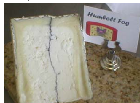
Humboldt Fog from Cypress Grove is one cheese that is destined for stardom.