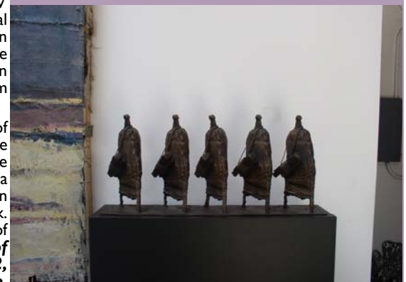
A bronze from the Journeyman Series.