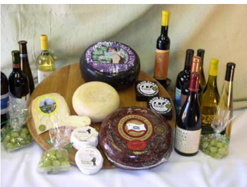
California's Delicious Artisan Abundance

In 1863 Abraham Lincoln, in a time of our nation's greatest crisis saw the good in this country and the blessings despite the pain and declared "The Last Thursday in November" to be a national day of thanksgiving. It was around that time that the focus of giving thanks changed from pious fasting to jubilant celebration.