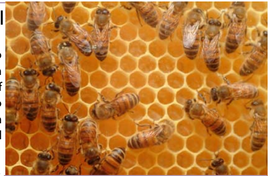
Industry and beauty are hallmarks of these small hard working animals.