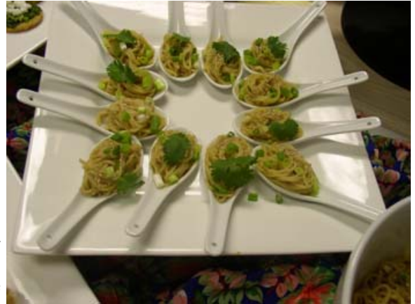
Spicy Sesame Noodles in Chinese Spoons are a one or two bite delight

It takes a lot of time and resources to conduct these classes. But it is an investment that I am certain will provide a good return. Next semester I think we might add décor classes but we will always focus on the food."