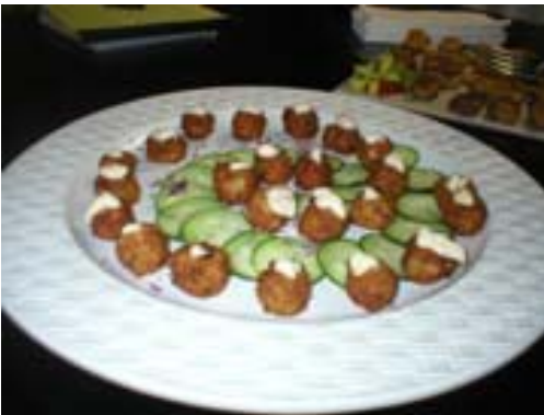
Mini Crab Cakes with Tequila Lime Sauce and Sliced Cucumbers by Jeffery Fliegler for PBP.