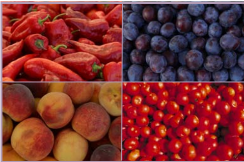
Natural Perfection in Brilliant Colors, Spicy Sweet and Soothing reasons to give thanks