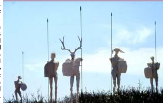
Viewed in the daylight the warriors become ghostly